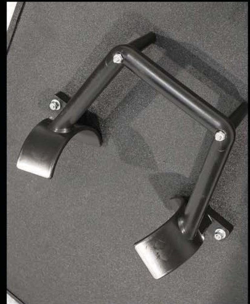
Ambidextrous Tri-Grip Handle